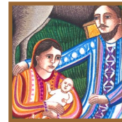
Cover art & details: Nativity

Tuesday, Jan 21 7PM Circle of Women , Library 7:30PM Men's Book Group , Offsite