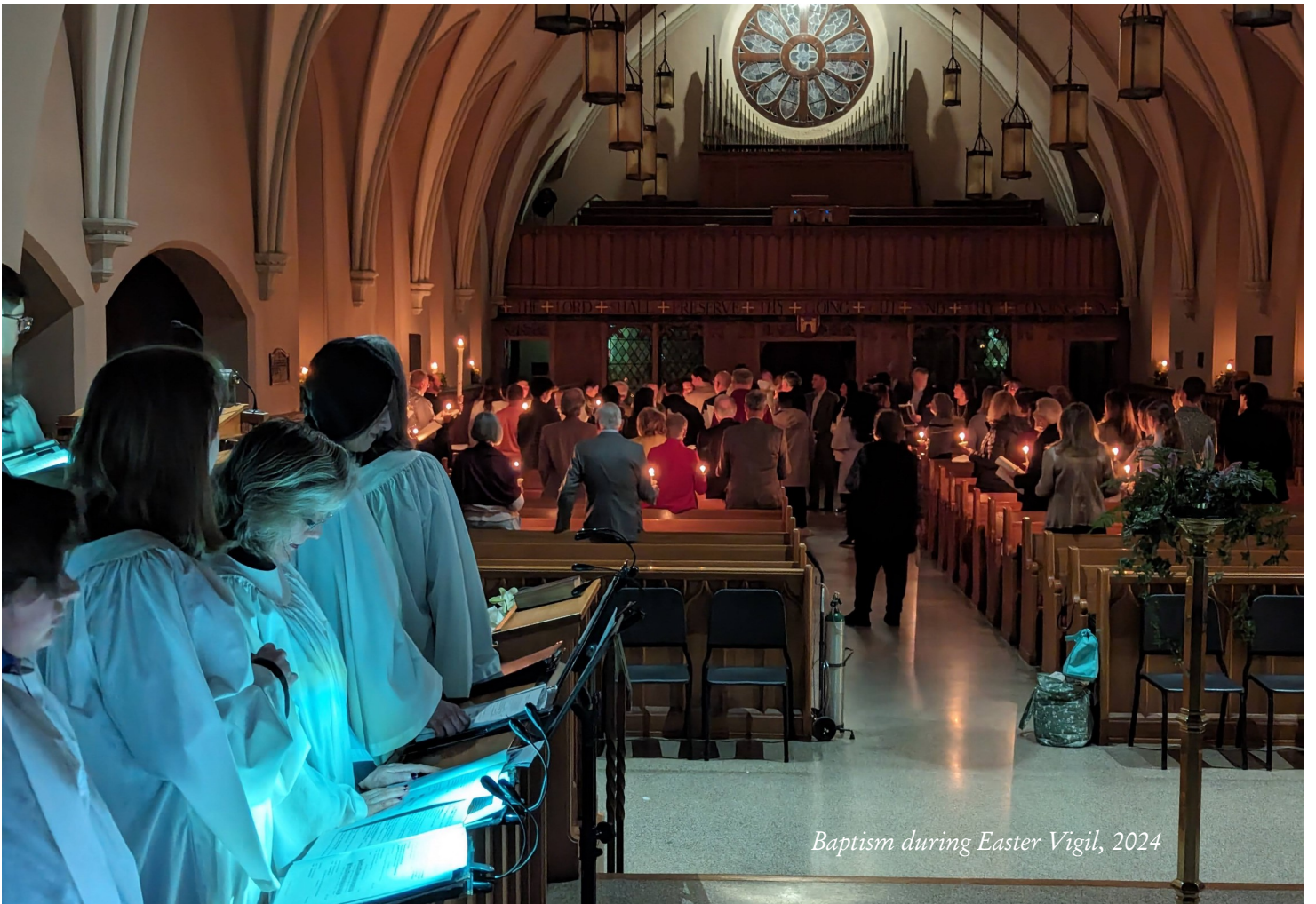
Baptism during Easter Vigil, 2024