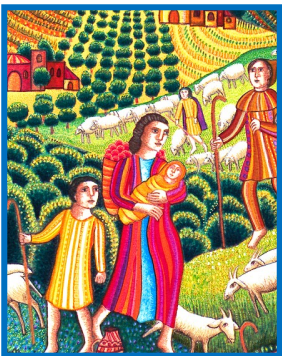
Cover art & details: Nativity © 2016 John August Swanson